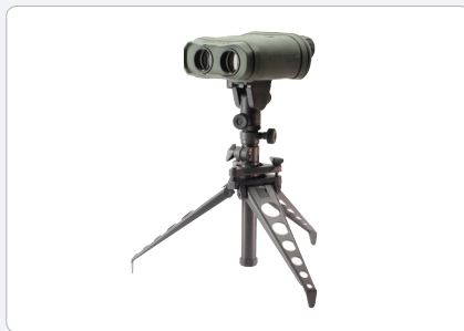
NC SST3-3S Tripod